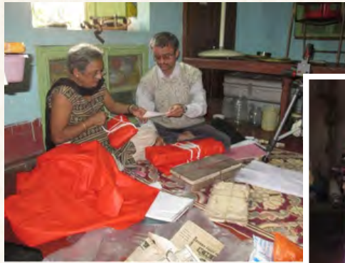
+ Bada Akhada, Nadia, West Bengal

The BRC field team collaborates with the community to uncover manuscripts in various repositories - villages, private collections, temples, libraries, and institutions