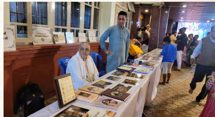
+ BRC team exhibiting rare literary artifacts and publications in Belagavi, Karnataka