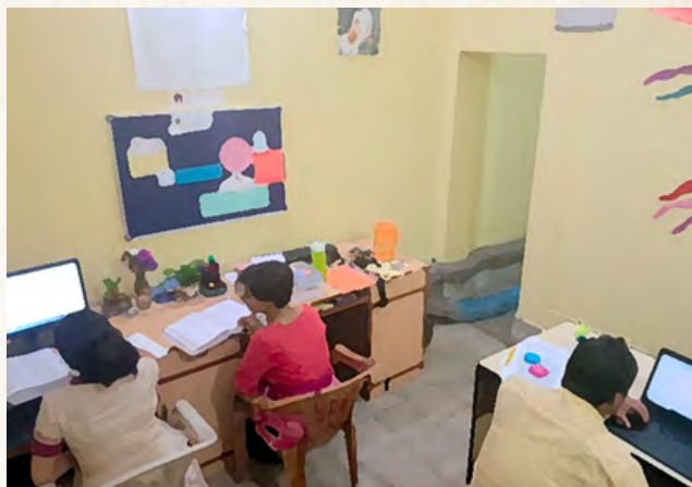
+ BRC Research Room