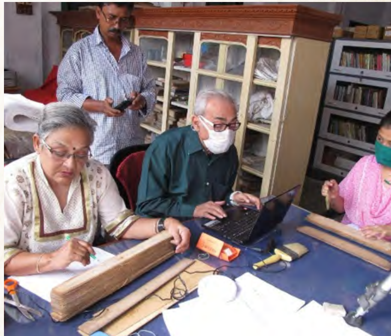
+ BRC experts cataloging a " Skanda Purana " palm leaf manuscript dated 1755 A.D. at Sadharan Granth Mandir, Nabadwip, West Bengal