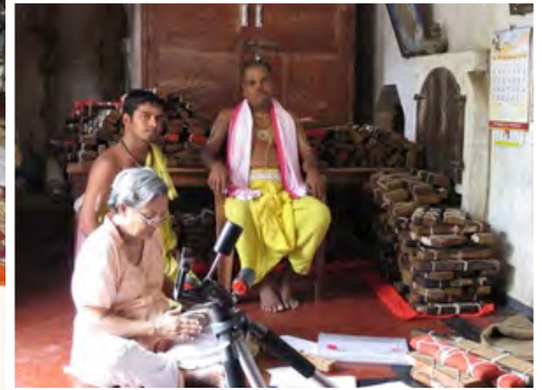
+ Odiya Math, Puri, Odisha